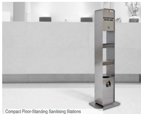
Compact Floor-Standing Sanitising Stations