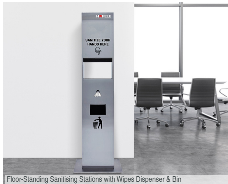
Floor-Standing Sanitising Stations with Wipes Dispenser & Bin

Keeping this in mind, Häfele's new Foot Panel Plate provides the users with a hands-free and safe way of exiting a premise / room. Mounted towards the bottom of the door, this foot plate offers an option to the users of pulling the door open with their foot instead of a door handle. The new foot plate, made of Stainless Steel Grade 304 can be used on doors that are frequently operated due to heavy traffic.