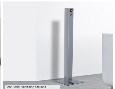
Foot Pedal Sanitising Stations