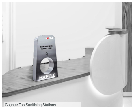
Counter Top Sanitising Stations