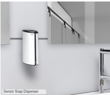
Sensor Soap Dispenser