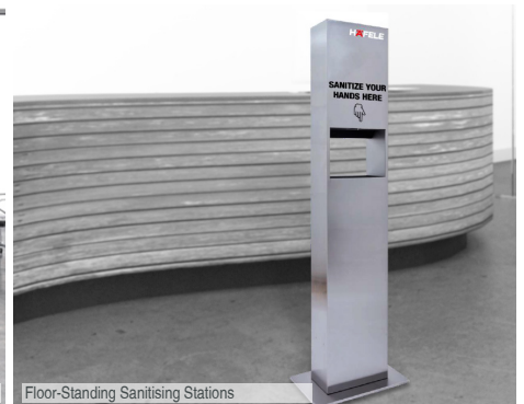
Floor-Standing Sanitising Stations