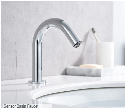
Sensor Basin Faucet

Complementing this, the Sensor Soap Dispenser has a flexible design making it easy to install in a number of places within your homes and work spaces. Both these products work on batteries preventing you the extra hassle of wiring during the set up.