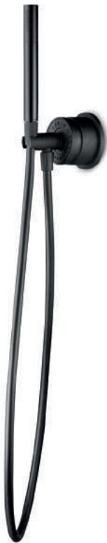
wall hand shower