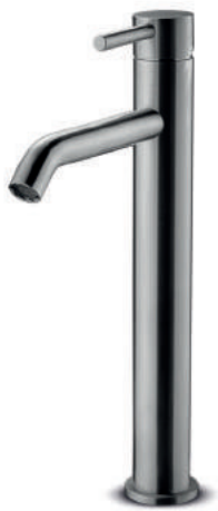
basin mixer high