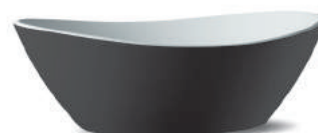
rio basin large