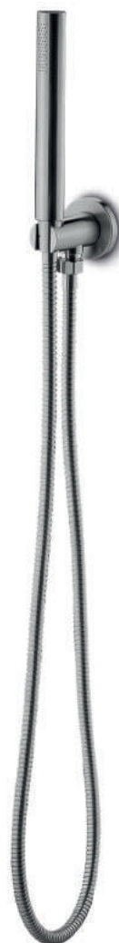
wall hand shower