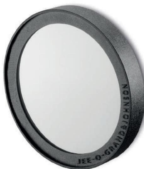
mirror Ø30 / 50 cm